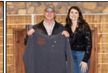
2024 Angus Group 1 Champion High Efficiency Bull Ramsey Angus