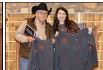
Salers Champion High Indexing Bull and Champion High Efficiency Bull, Elm Creek Ranch