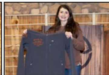
Charolais Co-Champion High Efficiency Bull Tustin Lake Charolais, not in attendance